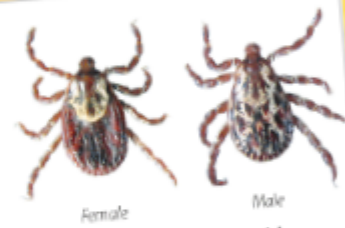
Dog ticks: Rocky Mt. spotted fever