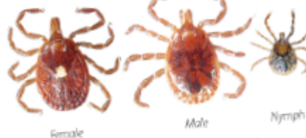
Lone Star ticks: Ehrlichiosis