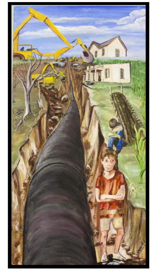
7 The Leaguer -April - August 2020

We also share with you Inspiration from LWV of Appleton, WI. Her Voice, Her Vote, Our History <a href="https://">https://</a> hervoicehervoteourvictory.com/. Learn about the Fox Valley 19th Amendment Centennial Coalition year-long series of nonpartisan events throughout 2020 to celebrate the 100th anniversary of the 19th amendment, with the goal of women's empowerment. This Coalition is a collaborative effort of women-run associations, organizations and clubs, all aligned in our desire to celebrate, educate and advocate women's rights.